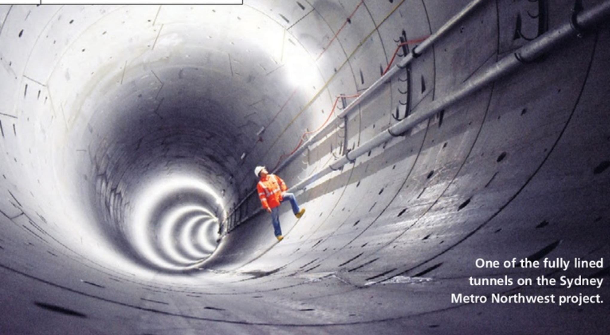
One of the fully lined tunnels on the Sydney Metro Northwest project.

strong quality assurance bias. The SDS system can be configured to any requirements but it must be ensured that the key desired interfaces are discussed early in the planning phase to enable cooperation and configuration."