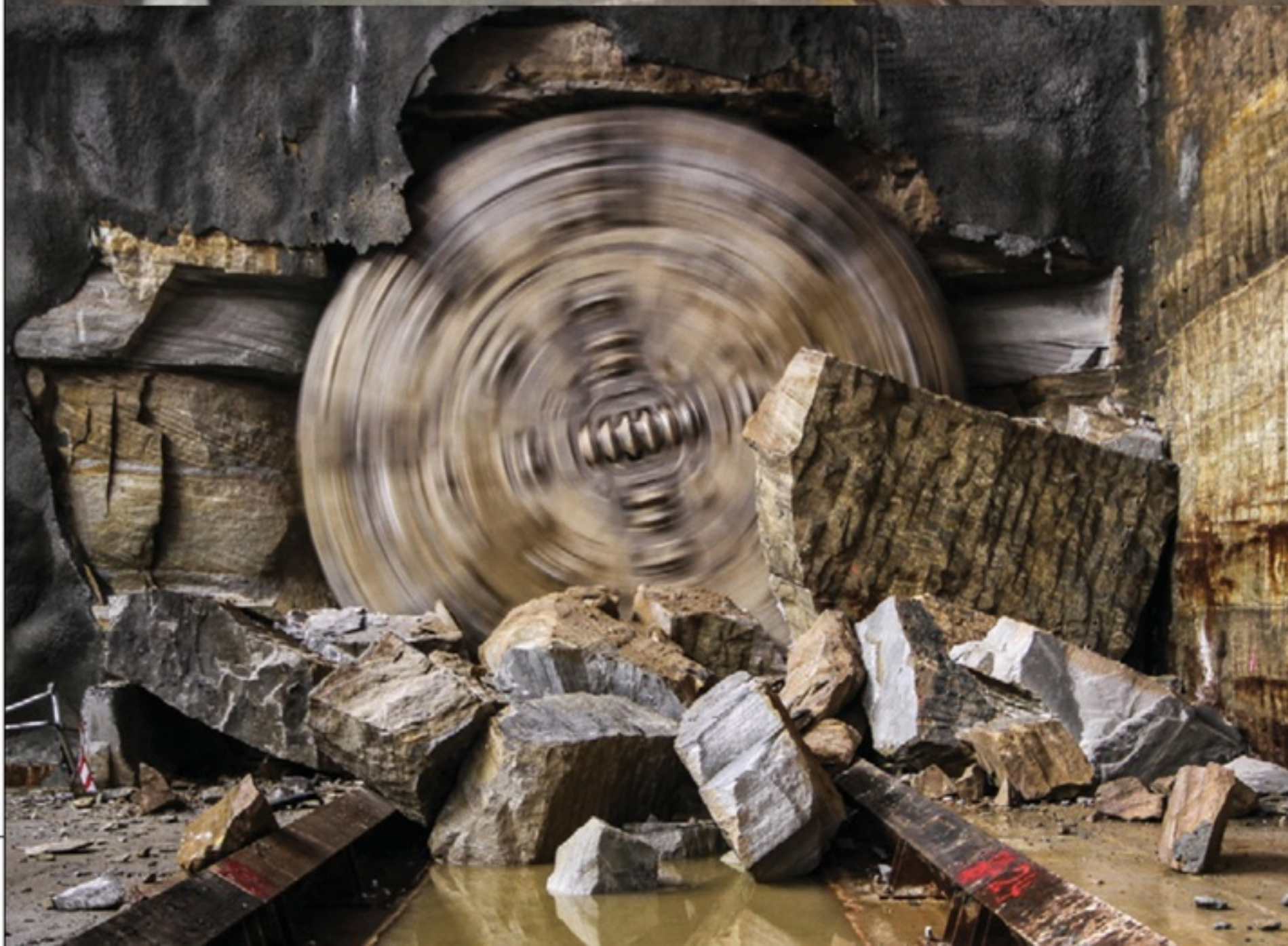
Below: A TBM breaking through on the one of the Sydney Metro Northwest tunnels.